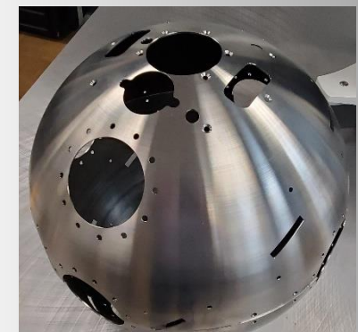
Stainless 316 L Spun & Machined