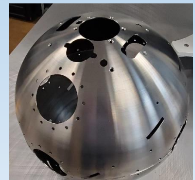
Stainless 316 L Spun & Machined