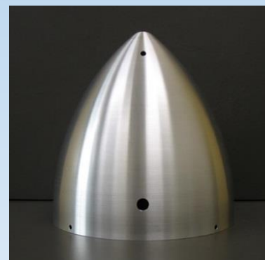
6061-O Alum, Spun Heat Treated to T6